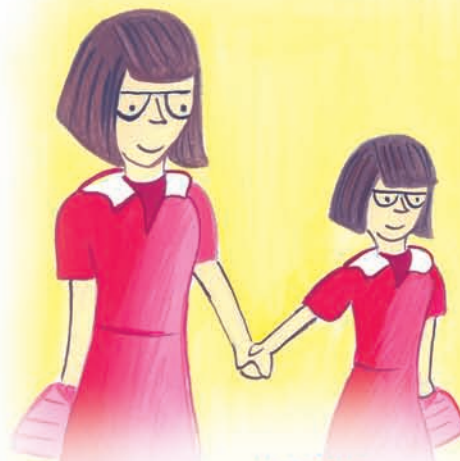
Sheila certainly took after her mother. They look just alike!